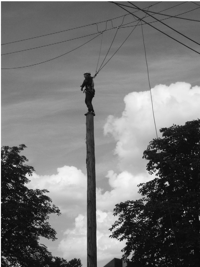
Figure 1 Subject during anxiety odor donation session.

The control samples were collected during a 20 min ergometer workout in the hospital of the Ludwig-Maximilians-University Munich on a different day. The subject's task was to workout with an estimated power of 110 W/h.